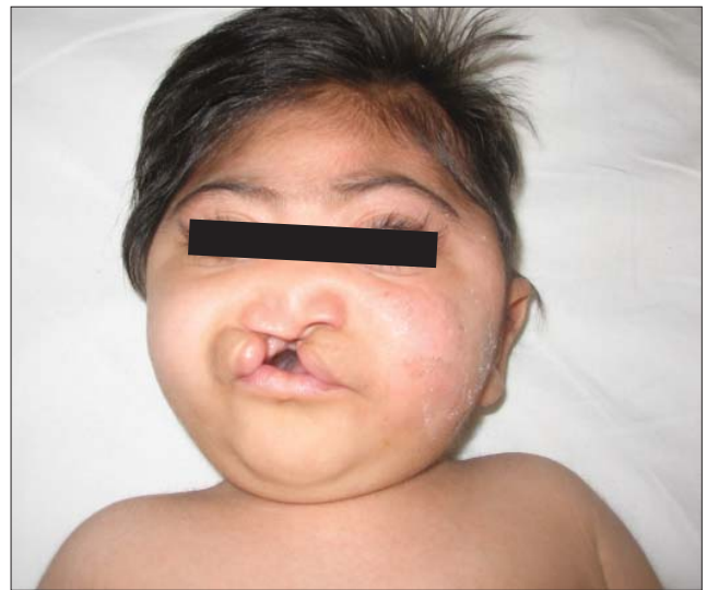
Figure 2. Microcephaly, bilateral cleft lip and flat nose