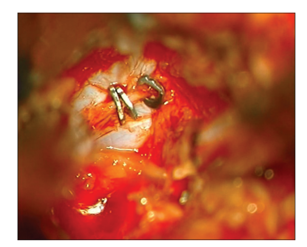
Figure 1: Incidental durotomy was repaired with nonpenetrating clips utilizing the quadrant retractor system

medical problems such as deep vein thrombosis, infection, and physical decompensation, which is related to prolonged bed rest as the patient is waiting for the