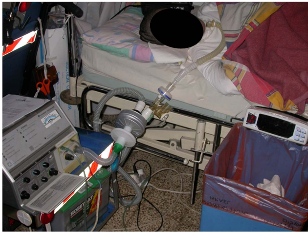
Measurements were taken proximal and distal to the filter.

Respiratory physiological parameters were measured using a Capnomac Ultima ventilation monitor (Datex-Ohmeda Inc., Madison, WI) and a Nellcor pulse-oximeter (Tyco International Inc., Princeton, NJ). Ventilation airflow parameters were measured using a Ventcheck respiratory mechanics monitor (Novamatrix Medical Systems Inc., Wallingford, CT).