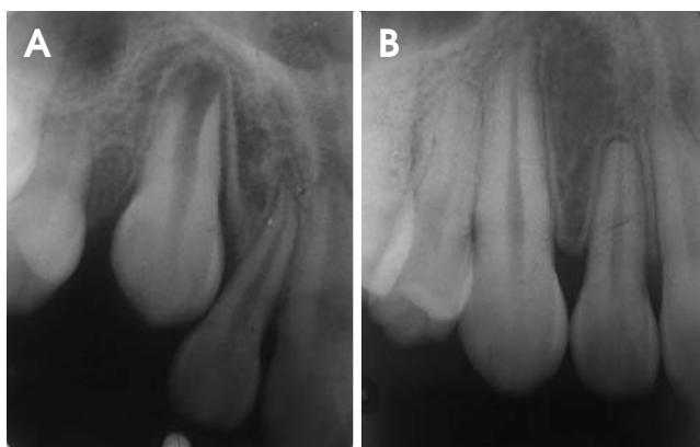
Fig. 2. A. Dilacerated maxillary lateral incisor before orthodontic treatment. B. Moderate external apical root resorption of dilacerated maxillary lateral incisor after orthodontic treatment.