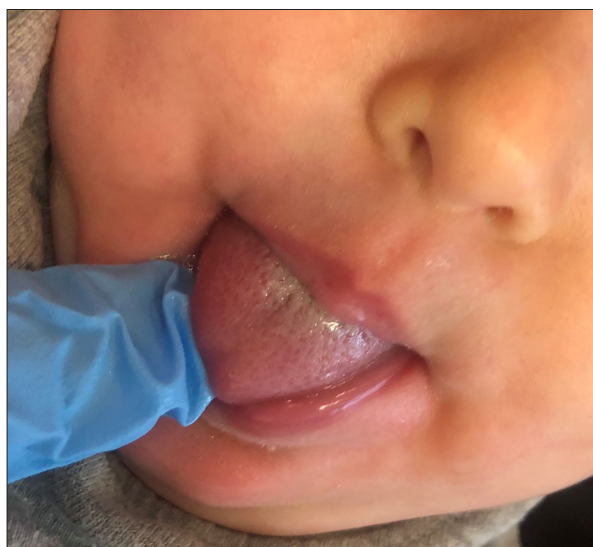
Figure 2. The tongue after 4 weeks of treatment.

was generally healthy, delivered on time by natural forces to healthy parents, without any family history of Addison's disease, Peutz-Jegher syndrome, or von Recklinghausen disease. She was exclusively breastfed. The initial diagnosis, made 3 weeks earlier by her pediatrician solely on the basis of clinical presentation of the tongue's lesion, was thrush. The doctor prescribed systemic antifungal treatment with Nystatinum (5×/day, 2000 units, per os), without prior mycological examination. The lesion was still present after 10 days. The pediatrician took a swab for confirmation of fungal infection. Although the result was negative, the doctor nevertheless retained the systemic antifungal treatment and referred the infant to the Department of Oral Pathology. Intraoral examination revealed dark, blackish, elongated tongue papillae, especially in the median-anterior part of the dorsum of the tongue (Figure 1). No