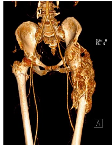
Fig. 2 3D reconstruction showing neurogenic heterotopic ossification associated with a proximal femoral fracture.

Two types of central nervous system trauma may lead to the formation of NHO of the hip: traumatic brain injury (TBI) 5,6 and spinal cord injury (SCI). 7 Most often, they concern polytraumatized patients, who usually require a period of critical care and have sustained various associated neurological and non-neurological lesions from the trauma. Furthermore, the degree of neurological recovery remains uncertain and unpredictable. As a consequence, clinical presentations are multiple. If we want a realistic indication adapted to individual functional demand, neurological status needs to be assessed, and other lesions have to be taken into account.