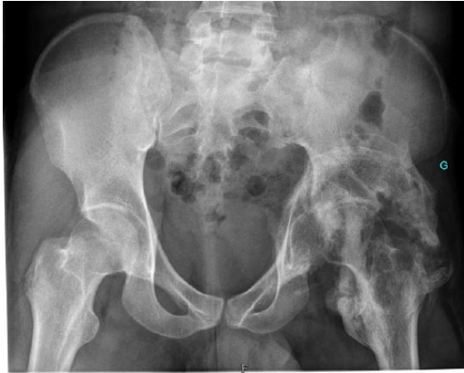
Fig. 1 Antero-posterior X-ray both hips showing neurogenic heterotopic ossification around the left hip and femoral head necrosis.

patient expectations, assessment for surgery should include the patient, or a representative. The overall goal of the multidisciplinary consultation process involves clearly defining the functional impediment produced by the heterotopic ossification, not only for the surgical team but also for the patient. Once a course of action has been negotiated a contractual agreement is made, which stipulates specific clinical gains that are expected from the surgical procedure. This contract describes the extent of resection that will be performed, as complete resection incurs significantly increased risk of morbidity. When indications are correct, results of the surgical response can include a long-lasting functionality of the hip joint. 4 The process of assessing NHO patients for surgical interventions that will lead to positive functional outcomes involves five main points, which will be discussed further. These include: understanding the disease background, pre-operative patient management, the surgical strategy, post-operative care, and the risks of infection and recurrence.