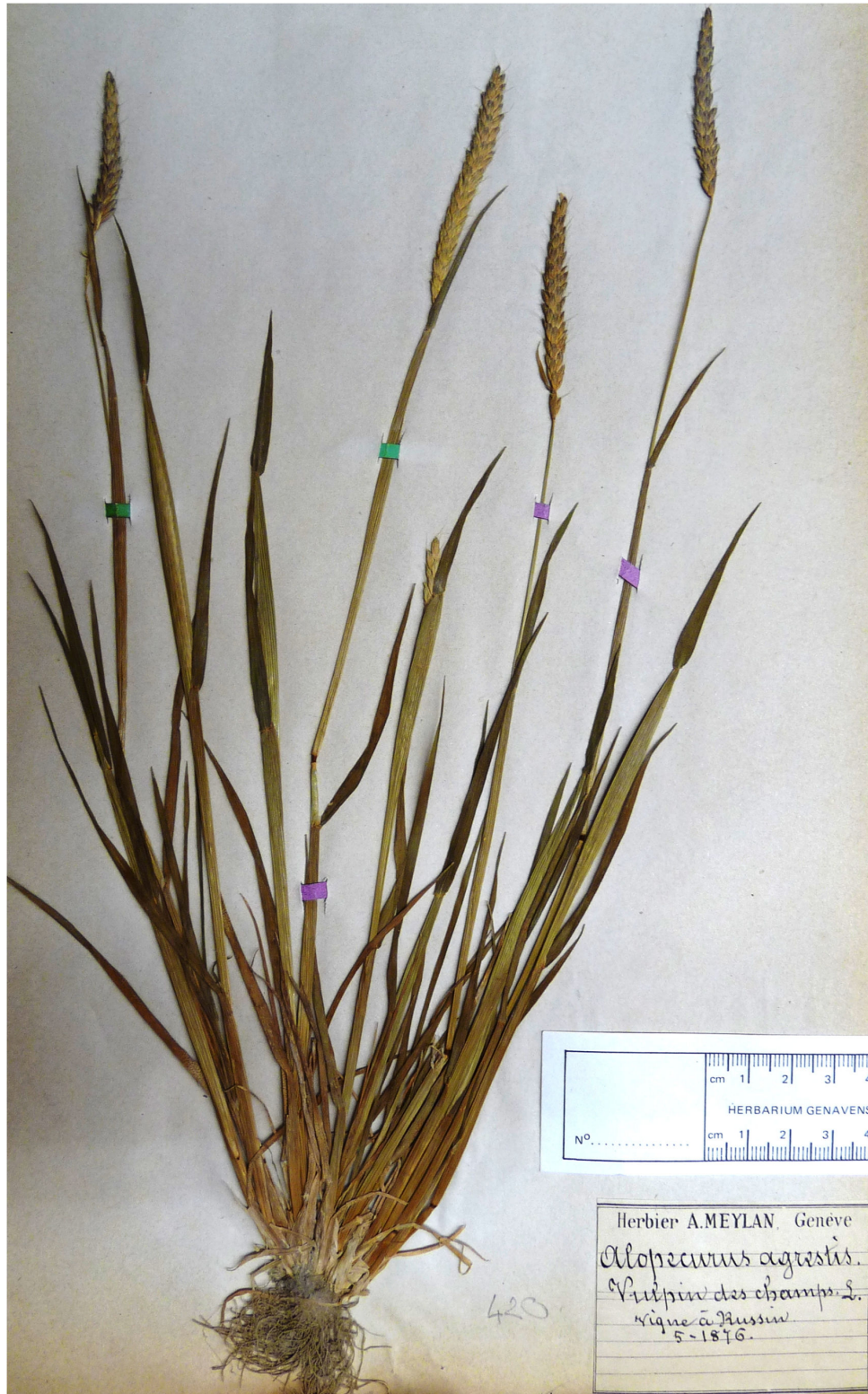
Figure 1. A. myosuroides herbarium specimen. . Specimen collected in May 1876 in a vineyard in Russin (Switzerland), and kept at the conservatory and botanical gardens of Geneva (Switzerland). This specimen is denominated Alopecurus agrestis , a former synonym for A. myosuroides .