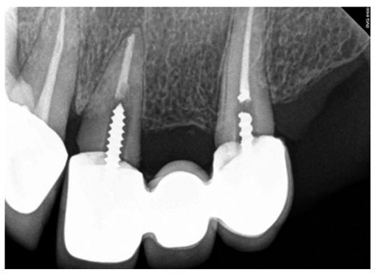
Fig. 3: Radiographic picture of a failed FDP as a result of failed posts.

failure of single unit fixed dental prostheses is due to caries, while porcelain fracture and loss are more significant in patient with multi unit FDPs.