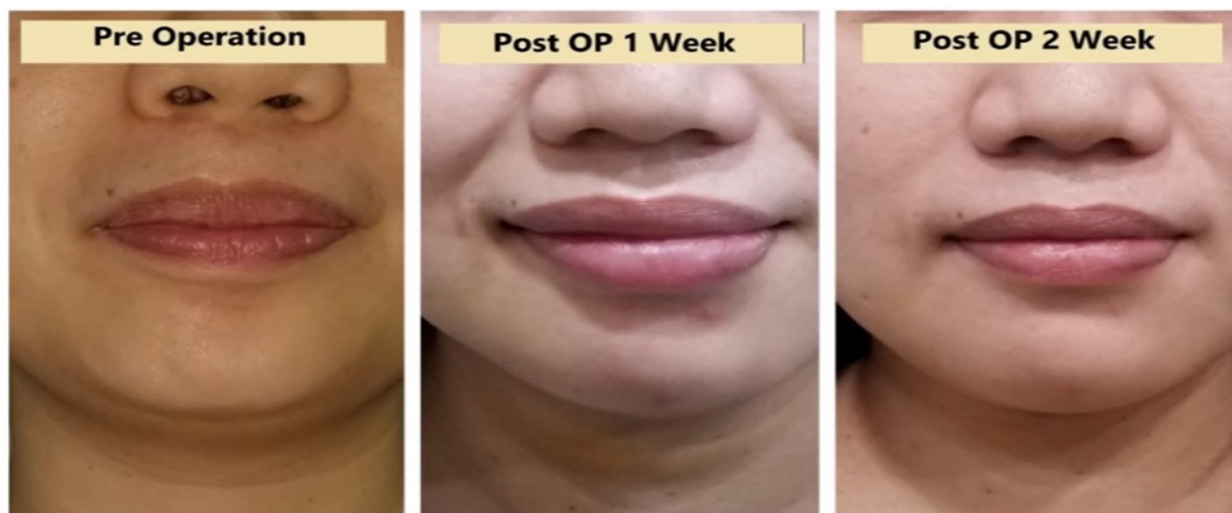
Figure 3. Profiles of a patient at the pre-operative stage and at first and second weeks following transoral endoscopic vestibular thyroidectomy.

The peri-operative profiles of a patient including her pre-operative and post-operative views at first and second weeks are shown in Figure 3.