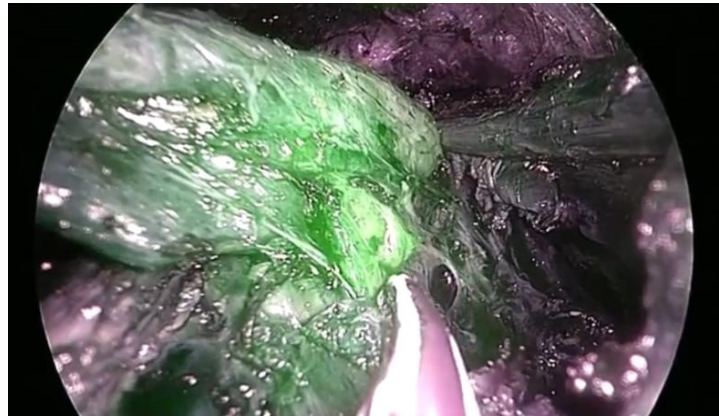
Figure 2. The use of indocyanin green fluorescence imaging for the intraoperative identification of the parathyroid glands during the transoral vestibular thyroidectomy.