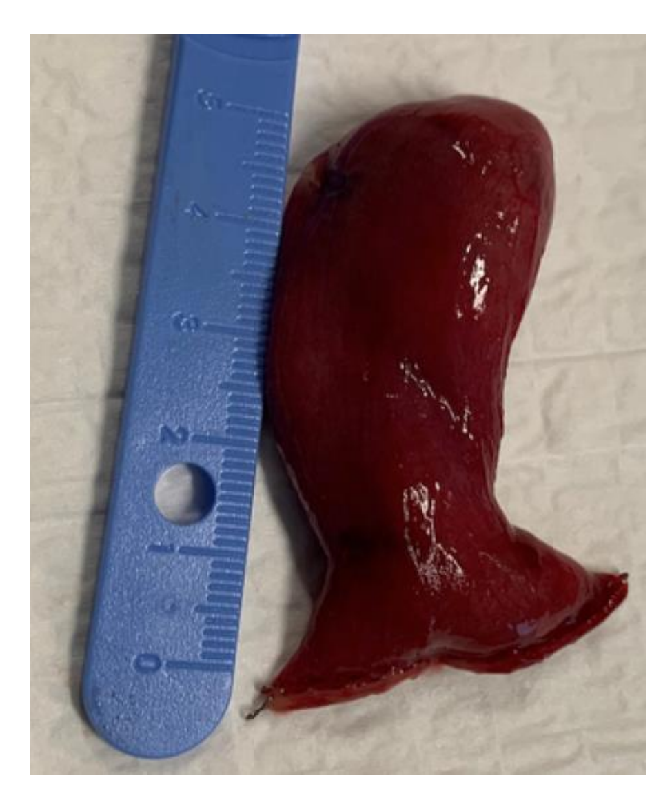
Figure 4: resected Meckel's diverticulum measuring 5cm