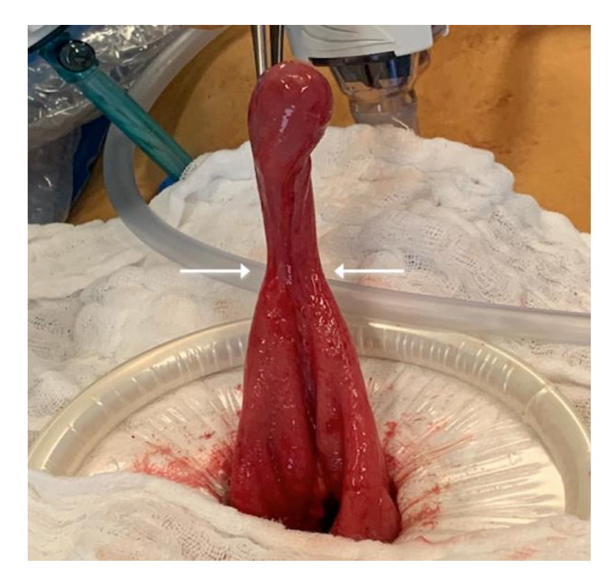
Figure 3 : Meckel's diverticulum prior to resection at the base (arrows)