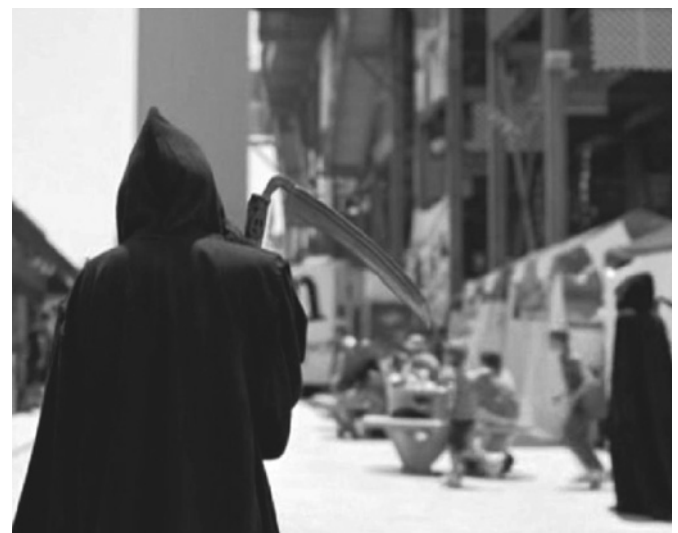
Figure 3 Scene from California Tobacco Control Program television advertisement to raise awareness about the deadly nature of free tobacco product distribution.