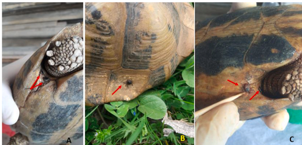
Fig. 3. Presence of Hyalomma ticks on the Hermann's tortoise shell

The results of our study, however, showed that tortoise size is one of