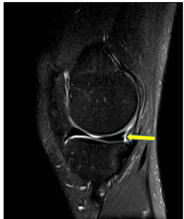
Fig 6. Type 4 grading, indicative of full-height fluid-signal meniscocapsular separation ( arrow ).

Our study aimed to determine an appropriately sensitive and specific imaging classification system to increase the confidence of preoperative ramp lesion diagnosis. The findings seen in type 3 and 4 lesions support the previously established criterion of a fluid-signal cleft as the most specific finding of an unstable meniscocapsular injury. 12-14 Investigating the ability of MRI to detect ramp lesions in patients undergoing ACLR, Arner et al. 8 reported a sensitivity of 53.9% to 84.6% with a specificity of 92.3% to 98.7%. In a study undertaken by DePhillipo et al., 9 it was concluded that MRI performed poorly (48% sensitivity) in detecting these specific injuries and that a focused intraoperative assessment was essential. A more recent study by Hatayama et al. 11 using a criterion of "high signal