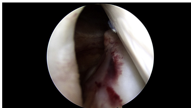
Fig 1. Arthroscopic image showing a ramp lesion as visualized via the intercondylar notch view.

therefore, formal arthroscopy in the posteromedial compartment has been recommended for surgical diagnosis. 2,7 Formal investigation in the posteromedial compartment during ACLR may not be routine surgical practice, reinforcing the importance of accurate preoperative detection of these lesions on magnetic resonance imaging (MRI). When compared with the gold standard of arthroscopy, the effectiveness of MRI for the detection of ramp lesions has only recently been explored. Existing literature has generally focused on repair techniques and surgical outcomes, with a relative paucity of literature evaluating the accuracy of MRI for ramp lesion diagnosis. 8,9