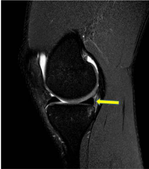
Fig 3. Type 1 grading, indicative of diffuse increased signal (arrow) equal to the adjacent femoral cartilage.

images. On the basis of experience, we developed a classification system for the vertically orientated signal characteristics at the posterior medial meniscocapsular junction, with grades ranging from type 1 to type 4. Whereas signal intensity less than the adjacent cartilage was classified as normal, the grades were classified as follows: type 1, diffuse increased signal equal to the adjacent femoral cartilage (Fig 3); type 2, diffuse increased signal greater than the adjacent cartilage (Fig 4); type 3, diffuse increased signal plus full-height linear fluid-signal cleft (Fig 5); and type 4, full-height fluid-signal meniscocapsular separation (Fig 6). “Full height,” indicated in types 3 and 4, describes complete involvement of the junction with no intact tissue identified. The presence of coexisting injuries to the posterior oblique ligament (POL), true intrameniscal medial tears, and injury to the medial collateral ligament was simultaneously recorded.