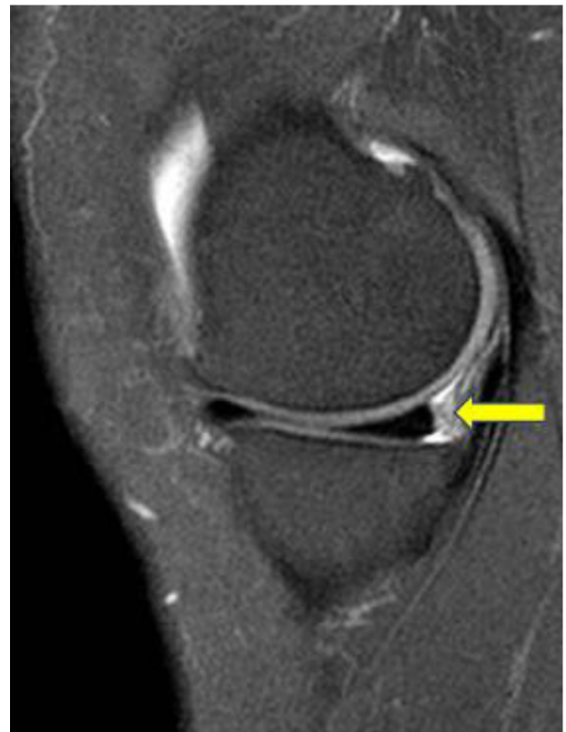
Fig 4. Type 2 grading, indicative of diffuse increased signal (arrow) greater than the adjacent cartilage.

The inter-rater reliability for all 93 cases was moderate, at 0.65, with the inter-rater reliability for the 11 positive ramp lesions being good, at 0.75. 10 Sensitivity, specificity, PPV, and NPV are shown in Table 1 for each of the 4 classification types. Type 3 criteria proved to be the most accurate, producing sensitivity values with an average of 85% (95% confidence interval [CI], 58%-98%) and specificity of 82%. Furthermore, an average PPV of 41% and NPV of up to