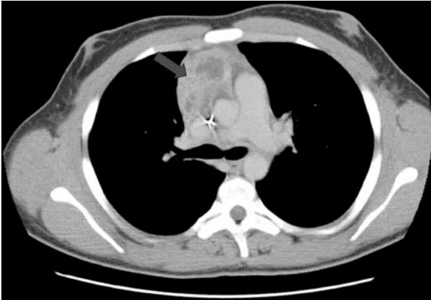
Figure 1. Computed tomography scan of thorax showing extension of infection with Aspergillus viridinutans into mediastinal structures (arrow).