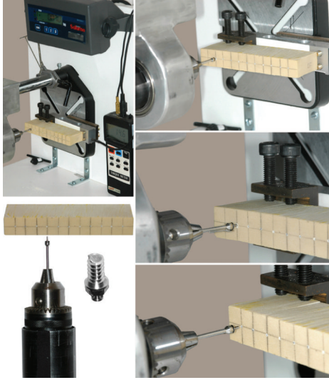
FIGURE 1: The equipment used for bone screw insertion in high-density artificial bone ( 0.80 \text{ g/cm}^3 ) and fracture.