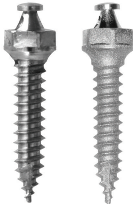
FIGURE 3: Nonsandblasted and sandblasted bone screws.

processes were compared between groups 2 and 3 with Mann-Whitney tests. A multiple linear regression analysis was performed taking into account the fracture torque as dependent variable to simultaneously evaluate the influence of two recycling processes, 5 different diameters, and weight loss on the mechanical strength of bone screws. Statistical analyses were performed with Statistica Software (Statistica for Windows 6.0, Statsoft, Inc., Tulsa, Oklahoma), at P < 0.05 .