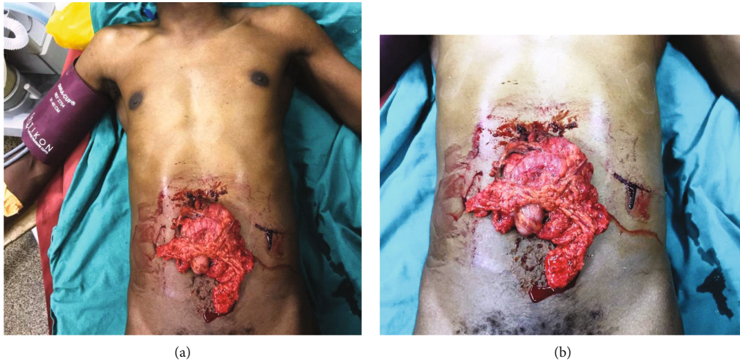
FIGURE 2: (a and b) Eviscerated omentum with transverse colon. Patient sustained penetrating abdominal injury from broken beer bottle.