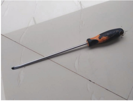
FIGURE 1: A similar standard 10-inch long screw driver used to inflict trauma in case one. As it is observed, it is long enough to transverse through anterior abdominal wall, intraperitoneal viscera up to retroperitoneal space traumatizing the IVC.

His blood pressure was 148/67 mmHg and pulse rate of 87 beats/min. Per abdomen he had two wounds on left lumbar area 3 cm in diameter with smooth margins entry wound with blood oozing and small bowel evisceration of about 4 cm and right lumbar area, and a rouged edged wound 2 by 3 cm exit wound. Abdomen was opened through extended midline incision. Intraoperative findings were complete jejunal transections at 90 cm and 110 cm from ligament of Treitz and 0.5 cm perforation at 120 cm. The rectus abdominis muscle on left lumbar area was transected with ruptured peritoneal fascia. About 20 cm of jejunum was resected and end to end anastomosis done. Rectus abdominis muscle was repaired with its underlying fascia. Abdomen closed and he was instituted on I/V ceftriaxone 1 g and metronidazole 500 mg 8 hrs. postoperative. Postoperative recovery was uneventful.