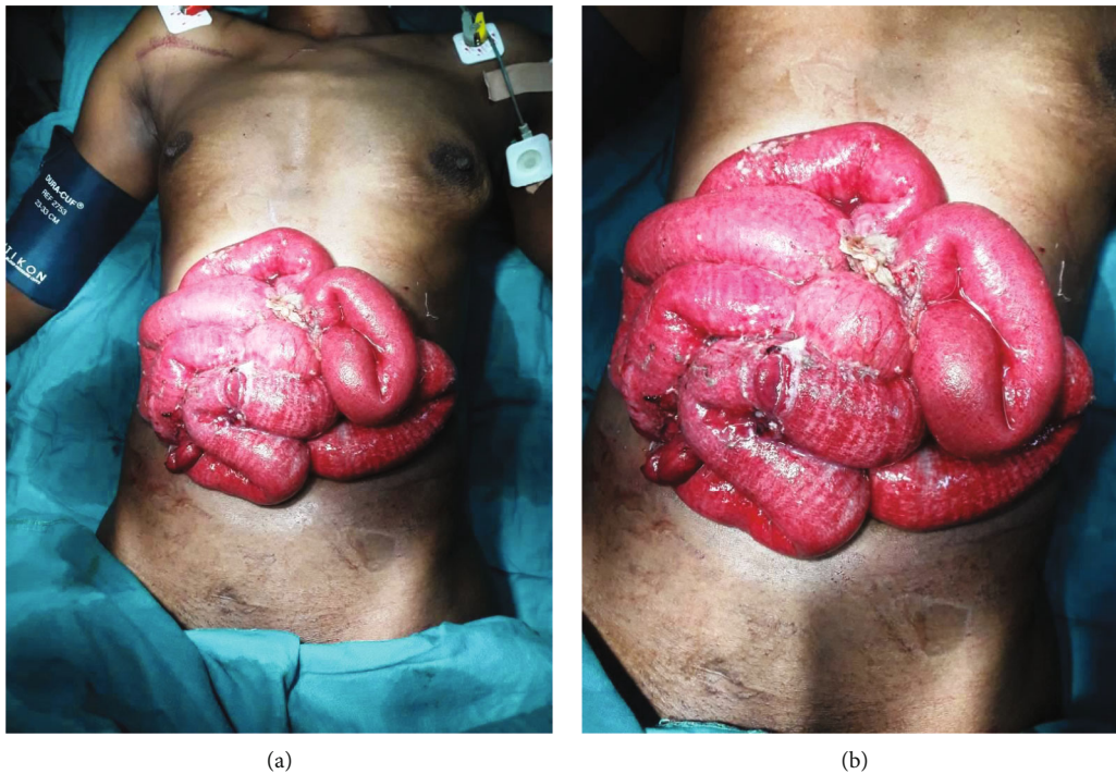
FIGURE 3: (a and b) Eviscerated small bowels with traumatic perforation in case three patient from knife stab wound.

not reveal the true nature of the assault and assaulting weapon. IVC injury was diagnosed intraoperatively and senior surgeon consult had to be done upon discovering the spectrum of injury involving major vessels. The emergency surgery was being conducted by relatively junior surgical residents prior the intraoperative consult. The IVC laceration bleeding was discovered during peritoneal cleaning with normal saline post repair of bowel and mesenteric laceration which dislodged the haematoma concealing the injury. Damage control surgery was then done involving repairing of the IVC laceration and peritoneal cavity packing with abdominal packs. Abdomen was closed