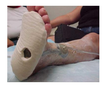
Figure 4. Application of 1/4 inch felt at week seven.

At week seven, the wound bed was clean, with less depth but with persistent rolled wound edges, despite debridement at each visit. It was decided to focus on further possible barriers to healing. The continued rolled wound edges suggested that offloading was not yet optimal. The use of ¼ inch Sammons Preston Orthopedic Felt<sup>®</sup> (Patterson Medical, Warrenville, IL, USA), an adhesive-backed felt, customized to offload the wound area and applied to the plantar surface of the foot, was initiated to further isolate pressure relief. AllKare Protective Barrier Wipe<sup>®</sup> (ConvaTec Inc, Greensboro, NC, USA), a skin prep product, was first applied liberally to the entire plantar surface. The negative pressure device was applied as noted earlier. The adhesive-backed felt pad was cut to fit the patient's plantar foot from the base of the toes to the heel. A relief hole was cut to correspond with the wound area. The felt was then applied directly to the plantar surface with the relief hole exposing the wound area. A DYNA-FLEX<sup>®</sup> (Systagenix, North Yorkshire, United Kingdom) three-layer compression wrap was then applied to the leg from the base of the toes to just below the knee. It was wrapped so that the negative pressure tubing was outside of the wrap to avoid additional pressure areas. The boot was then applied (Figures 4–6). All of this was changed twice a week at the wound clinic.