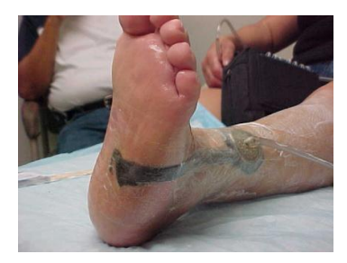
Figure 3. Application of NPWT at week 4.

By week four, results of the WBC scan were obtained and were negative for osteomyelitis. The wound bed was clean and granular but still with significant depth. To better address wound depth, negative pressure wound therapy (NPWT) was initiated using the Vacuum-Assisted Closure (V.A.C.)<sup>®</sup> (KCI San Antonio, TX, USA) device, modified by bridging the tube attachment pad to the distal leg with foam to avoid tubing pressure on the plantar surface (Figure 3). NPWT settings were 125 mmHg, continuous. This was changed three times a week. Weekly debridements and offloading were continued.