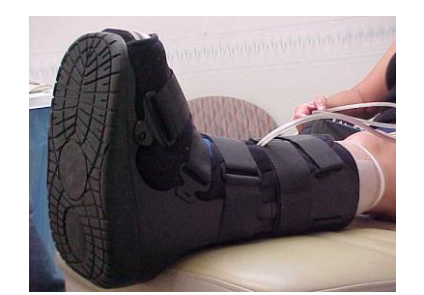
Figure 6. Felt, wrap and boot in place at week seven.

At week eight (Figure 7), NPWT was discontinued, as the wound depth had filled in with granulation tissue. The wound bed was now well prepared, and Apligraf<sup>®</sup> (Organogenesis, Canton, MA, USA), a bi-layered living skin equivalent, was applied and held in place with adhesive strips. This was covered with a non-stick contact layer of Mepitel<sup>®</sup> (Molnlycke Health Care, Norcross, GA, USA). Felt padding was again applied to the plantar surface. Silver hydrofiber and dry gauze were applied to the wound over the cut out portion of the felt. The three-layer wrap and offloading boot were reapplied. The patient returned to the clinic for weekly dressing changes.