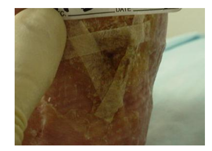
Figure 8. Appearance of wound at week 12, after re-application of bi-layered living skin equivalent.

At week 12, the bi-layered living skin equivalent was re-applied (Figure 8). Dressings, offloading and wraps were continued as before. It had been arranged for a local orthotic company to come to the clinic during the patient visit to mold her feet for new custom molded diabetic shoes in anticipation of approaching wound closure.