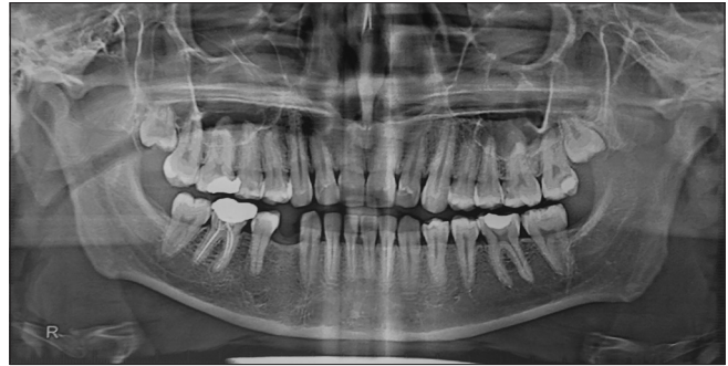
Figure 4: One-year postoperative orthopantomogram revealed adequate healing and near normal alignment of the previously displaced roots of adjacent teeth

The extrafollicular type commonly presents as a well-defined, unilocular radiolucency found between, above or superimposed upon the roots of erupted, permanent teeth, which often leads to the preoperative, tentative diagnosis of a residual, radicular, globulo-maxillary or lateral periodontal cyst depending on the actual intraosseous site of the lesion. [4,5] The cut surface may reveal a solid tumor mass or show one large or several small cystic spaces containing a yellowish, semi-solid material with an unerupted tooth found embedded in the tumor mass or projecting into a cystic cavity. [14] From the foregoing, it is evident that most AOTs do present as cystic lesions clinically and pathologically whether follicular or extrafollicular. In addition to their presentation, there are various reports which claim the origin or association of an AOT with a cyst or cystic neoplasm which is discussed in the following section.