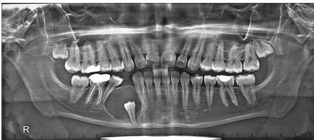
Figure 1: Orthopantomogram revealed a well-circumscribed radiolucency involving right mandibular first premolar and displacing the roots of adjacent teeth

On microscopic examination, a large cystic space lined by 2-4 cell thickness, nonkeratinized stratified squamous