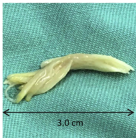
Fig. 3. The piece of chicken meat removed via bronchoscope.

day and to home after one week of hospitalization.