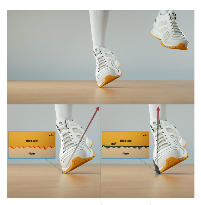
Figure 2 Preventive mechanism of Spraino: in case of a bad landing, Spraino minimises the otherwise high shoe—surface friction at the lateral edge of the shoe. This minimises the horizontal ground reaction forces (GRFs), thereby bringing the GRF vector closer towards the joint centre which serves to prevent excessive ankle inversion and internal rotation.

Participants were recruited from 91 indoor sports teams (handball, basketball and badminton) competing at divisional or league level in Denmark. Participants were eligible for inclusion if they: (1) were aged 18 years or older; (2) could read, speak and understand Danish; (3) could receive and reply to text messages using Short Message Services (SMS); (4) performed indoor sport in a subelite level team with at least 2 weekly practice sessions; (5) had incurred at least one lateral ankle sprain in the preceding