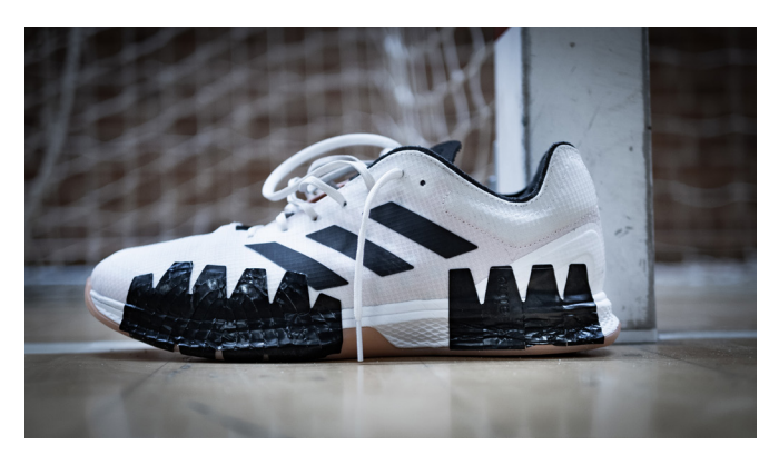
Figure 1 Indoor sports shoe with Spraino low-friction patches attached on the outside.

S6) was developed using the PREPARE trial guide<sup>12</sup> and Standard Protocol Items: Recommendations for Interventional Trials (SPIRIT) checklist.<sup>13</sup> We report the trial using the Consolidated Standards of Reporting Trials (CONSORT) 2010 extension for pilot and feasibility trials.<sup>14</sup>