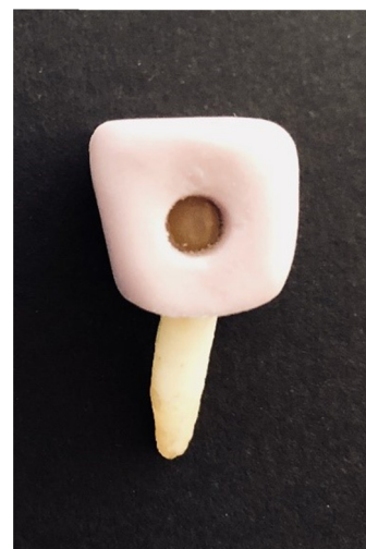
Fig. 2 Individualized silicone guide.

Color measurement was carried out inside a metamerism box (Mako, Rio Negro, PR, Brazil) by spectrophotometer Vita Easyshade® (Vita, Brea, CA, USA). The appliance was cali-