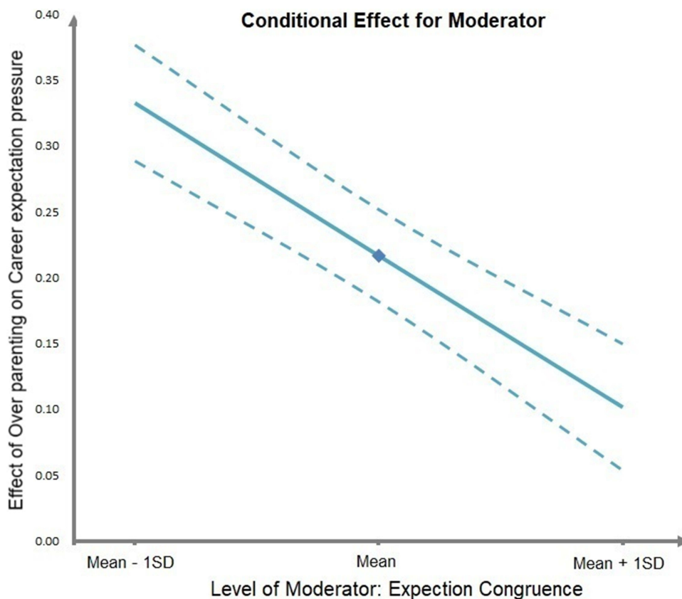
Figure 2 The conditional effect of overparenting on career expectation pressure for expectation congruence.

significantly moderates the relationship between overparenting and career indecision as well. It meant that the positive effect of overparenting on career indecision was lower when college students had higher levels of expectation congruence. We plotted this changing effect in Figure 3.