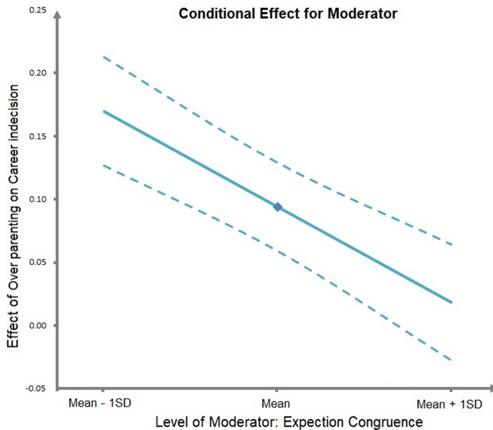
Figure 3 The conditional effect of overparenting on career indecision for expectation congruence.

Notes: Solid lines represent the Effect between variables at different levels of expectation congruence; Dashed lines represent the upper and lower limits of the 95% confidence interval.