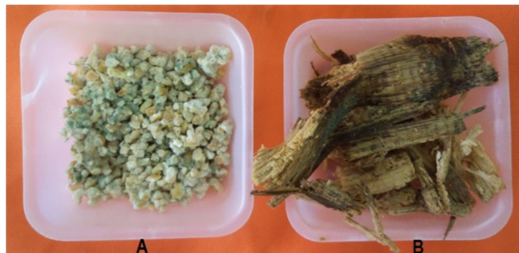
Figure 3 Trichoderma sp. SL2 grows well on corn (A) and sugarcane bagasse (B) indicated by the green coloration.

with ambient temperatures of 26 – 34°C, and placed in a seedling tray. Ten five-day old rice seedlings were grown singly in 15 × 15 cm plastic containers containing each treatment and control. Water was maintained at 2 cm level from the soil surface and actively