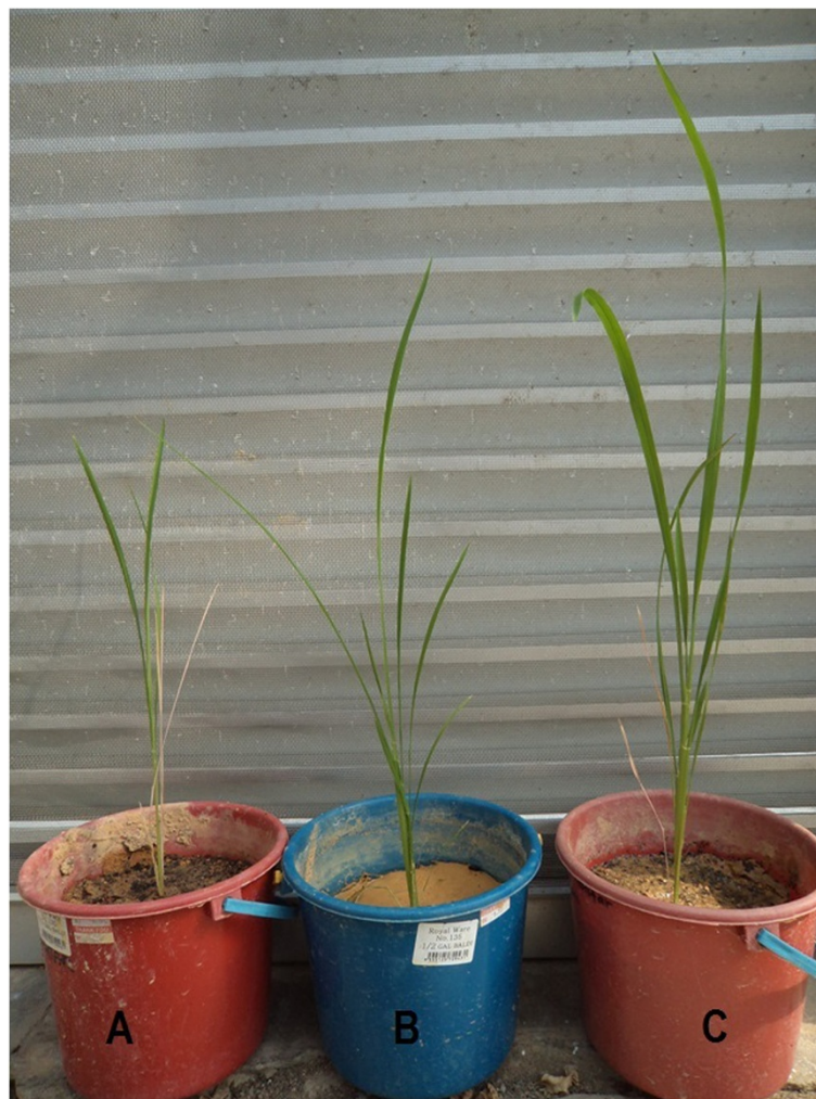
Figure 1 Rice seedlings treated with (A) control, (B) sugarcane bagasse formulation, (C) corn formulation.

was grown in potato dextrose agar (PDA) and incubated for seven days at 30°C. After incubation, spores of the Trichoderma spp. were harvested and diluted with sterilized distilled water until the spore population density reached a value of 10^8 spore/ml. Ten ml of Trichoderma sp. SL2 spore suspension was sprayed to 500 g of the respective carrier, stored in a sterilized polyethylene plastic bag and then incubated for ten days at 30°C. The dosage of Trichoderma sp. SL2 formulation was set at 5 g per 1 kg of soil. The inoculated soil was placed in a 15 × 15 cm plastic container.