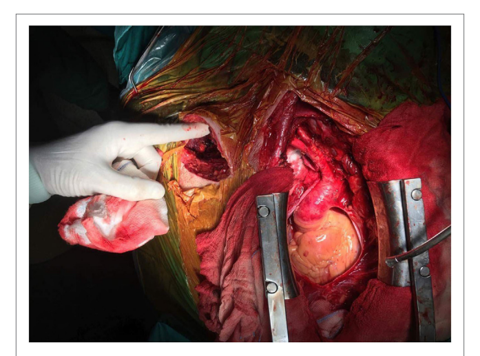
FIGURE 5 | Median sternotomy with right infraclavicular incision. Note the PTFE graft at the origin of right subclavian artery.