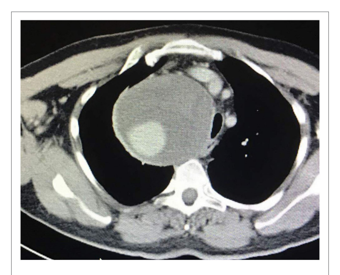
FIGURE 2 | Axial-coronal computed tomography imaging shows a giant right subclavian aneurysm of 12 cm diameter.

After systemic heparinization and blocking of innominate, right common carotid, and axillary arteries, aneurysm was incised. Thrombus was removed from the sac, and hemorrhage from the