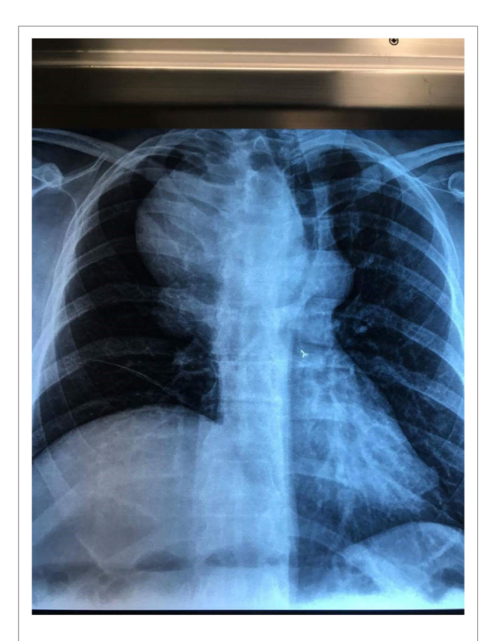
FIGURE 1 | Chest X-ray shows a mass in the upper lobe of right lung with displacement of the trachea to the left and elevation of right diaphragm.

Under general anesthesia, a right infraclavicular incision was first performed. After dissection of the pectoralis major muscle, opening of the clavipectoral fascia, and partial division of the pectoralis minor muscle, access to the right axillary artery was