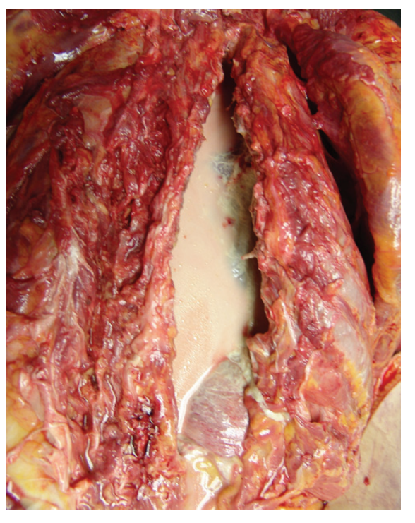
Figure 1 – Autopsy posterior view of the thoracic cavity. Note the milky enteral nourishment fluid covering almost all pleural surfaces. Diaphragm is seen in the bottom.