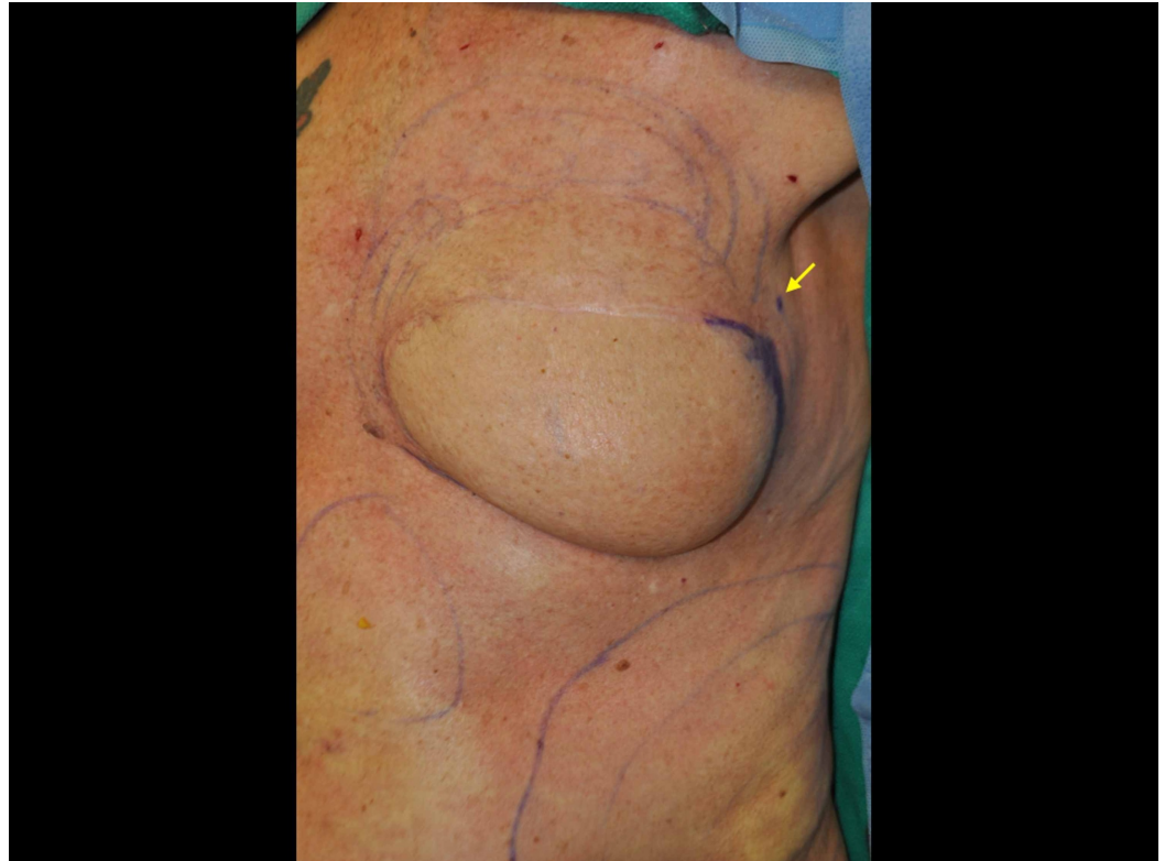
FIGURE 1: Preoperative markings demonstrating the planned lateral autologous flap incisions for release from the lateral chest wall soft tissues

flap incisions used for the release of the flap, and critical transition lines of the breast, specifically the inframammary fold and the planned anchoring position to the pectoralis major (Figure 1). This anchor position is determined by the manual elevation of the lateral breast flap tissues to the anterior axillary fold and evaluation of the resultant lateral breast curve. If concurrent revision procedures are to be completed, their markings are completed as indicated. Fat grafting donor sites of the abdomen and flank and their recipient sites are marked.