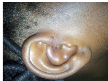
Figure 2. Preauricular sinus abscess of the right ear.

Preauricular sinuses, once infected are prone to frequent and recurrent infection hence prior to presentation more than 50% of the subject had three episodes per year. This is due to residual bacteria in the sinus and susceptibility of the preauricular sinus to infection. Also recurrent preauricular sinus abscess in our study was related to the