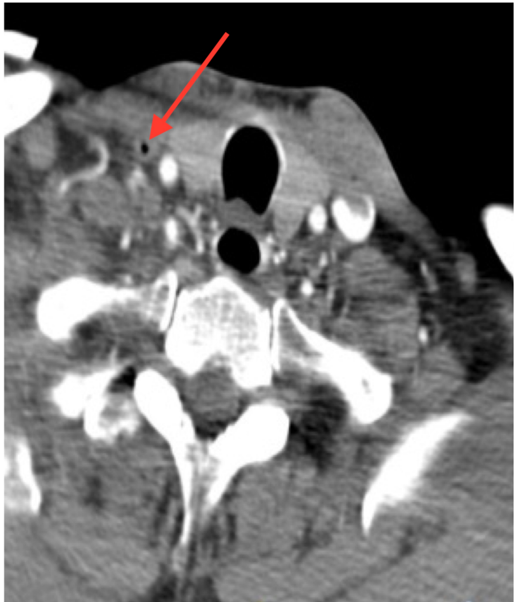
FIGURE 2: Coronal slice from the computed tomography (CT) angiogram at the level of the trachea with a red arrow showing air in the right internal jugular vein

Transoesophageal echocardiogram did not reveal any evidence of patent foramen ovale (PFO), atrial septal defect, or any evidence of left ventricular (LV) thrombus post-myocardial infarction (MI). The CT angiogram did not demonstrate any evidence of acute thrombus, and there was no evidence of any haemorrhage on the CT of the brain.