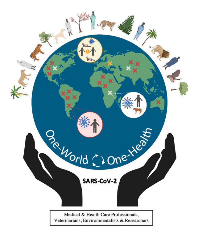
Figure 3. SARS-CoV-2 and the One-World – One-Health concept. It emphasizes that human health is dependent and intricately connected with that of animals (domestic and wild), birds and plants. A disturbance in the ecosystem results in human diseases (zoonotic or reverse-zoonotic). The letter X denotes a zoonotic event; the color red, white and yellow depict potential primary, secondary and tertiary zoonotic events, respectively.

CoVs have struck humans, and the probability of another one is quite certain. This scenario leaves no option other than adopting One Health-One World approach. It is worth noting that about 60% of known infectious diseases in humans are zoonotic and about 70% of emerging infectious diseases in humans are also of zoonotic origin [77]. Several factors may account for the increases in infectious diseases of zoonotic origin. They include climate change, urbanization, rapid population growth, expansion of new geographic areas, lifestyle changes, eating habits, intensive farming systems, deforestation, land use changes, increased human national and international travel, and increased movements of animals and animal products across the globe for trade. These changes affect human and animal health, and the ecosystems, resulting in rapid spread of infectious diseases. They increase the probability of SARS-CoV-2 jumping not only from animals into humans through primary and secondary zoonotic events, but also from humans to animals through reverse spread. They also enhance the potential for emergence of new genotypes, pathotypes and/or antigenic types of SARS-CoV-2. Because of the ability of the virus to infect multiple host species, it could be quickly shipped via asymptomatic human carriers, infected animals and/ or food products from one location to the other.