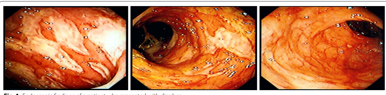
Fig. 1 Endoscopic findings of a patient who presented with diarrhea

A 44 year old Hispanic man presented with diarrhea for 7 days prior to admission followed by constipation, rectal discomfort, and melena. Past medical history was significant for hepatitis C infection. Physical examination findings included diffuse abdominal tenderness. Lab results were significant for elevated transaminases and total serum bilirubin of 1.2 mg/dL. Stool examination was positive for Clostridium difficile toxin. An abdominal and pelvic CT scan showed thickening of the rectal wall. A subsequent colonoscopy showed a normal terminal ileum, with congested, erythematous, eroded, granular mucosa throughout the colon and rectum. No areas