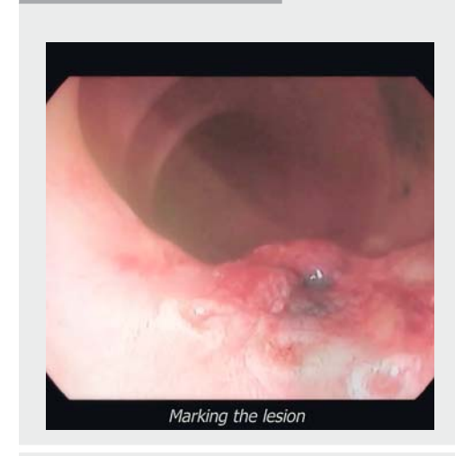
▶ Video 1 Full-length video of endoscopic full-thickness resection in patient #4 performed with the Full-Thickness Resection Device (FTRD®) System.

Our positive experience with EFTR has some inherent limitations. Despite being prospectively designed, the main drawback of this pilot study is the relatively short follow-up, which includes patients with a full negative oncologic work-up at 6 to 18 months since the time of EFTR. Secondly, six patients are not enough to rule out the risk of potential EFTR-related complications, such as the entrapment of other pelvic structures close to the rectal wall; to date, such complications have never been documented in the literature [6-12]. Finally, a complete full-thickness rectal excision was not feasible in one-third of our pa-