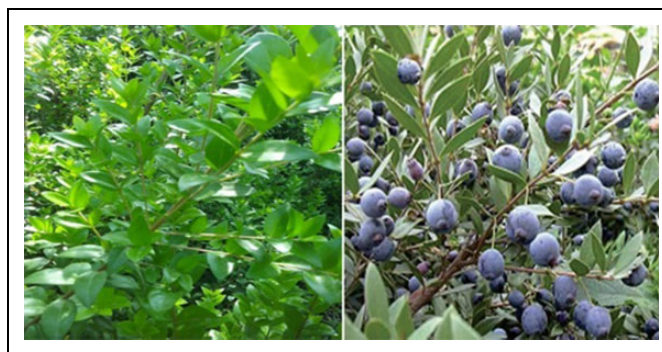
Figure 1. Myrtus communis Linn.

Extensive ethnopharmacological studies demonstrated that M communis L is endowed with promising pharmacological