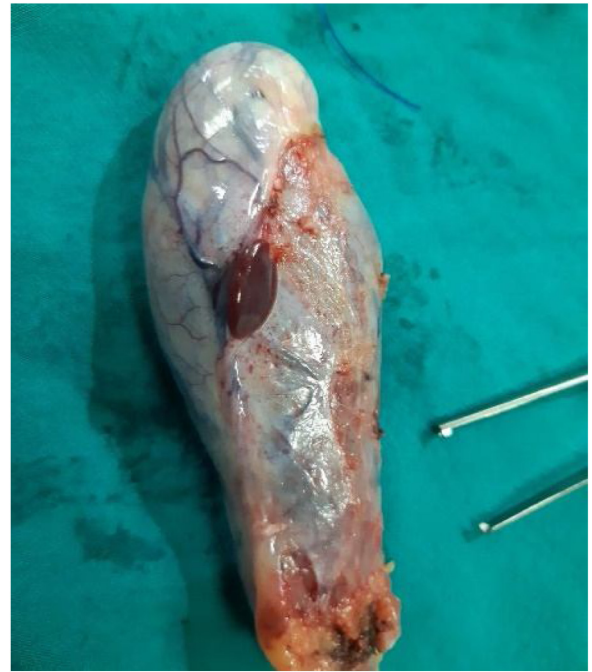
Fig. 2. Gross image of resected specimen with ectopic liver tissue attached on the gallbladder.

Ectopic hepatic tissue is a rare condition [7]. The real incidence of ectopic hepatic tissue attached to the gallbladder wall is difficult to assess but is reportedly 0.24–0.47% of the population though as with other sites, most of the cases of ectopic hepatic tissue attached to the gallbladder are diagnosed at laparotomy, laparoscopy or during an autopsy. Even though the gallbladder is the main site for the development of ectopic hepatic tissue, this finding is still exceptional [2,4].