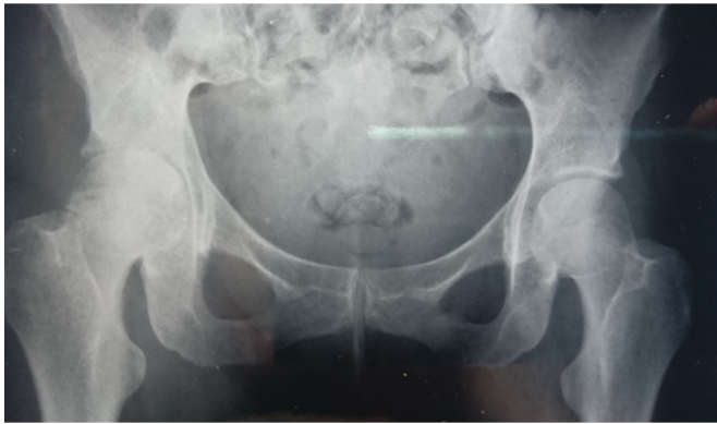
Figure 1: X-ray showing complete loss of joint space in the right hip.

S. aureus is the most common pathogen [4]. Drug addicts are at risk of developing epiphyseal aseptic bone necrosis, especially of the femoral head due to the obliteration of epiphyseal arteries secondary to hemolytic and thrombotic reasons. The first seems due to self-administration of distilled or saline water which is capable of inducing hemolysis. The second depends on the release of inert substances into the circulation such as talc, chalk, or marble dust used to cut the heroin [2, 5]. Drug abuse can cause hepatic disease which represents one of the possible etiological factors in the cause of osteonecrosis [6]. Other authors have later confirmed this connection between hepatic diseases and avascular necrosis of the femoral head [7, 8].