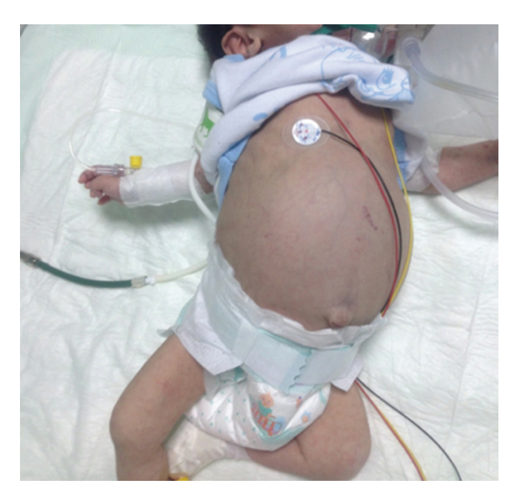
Figure 1. Two-month-old female patient with Wolman disease, showing abdominal distension.