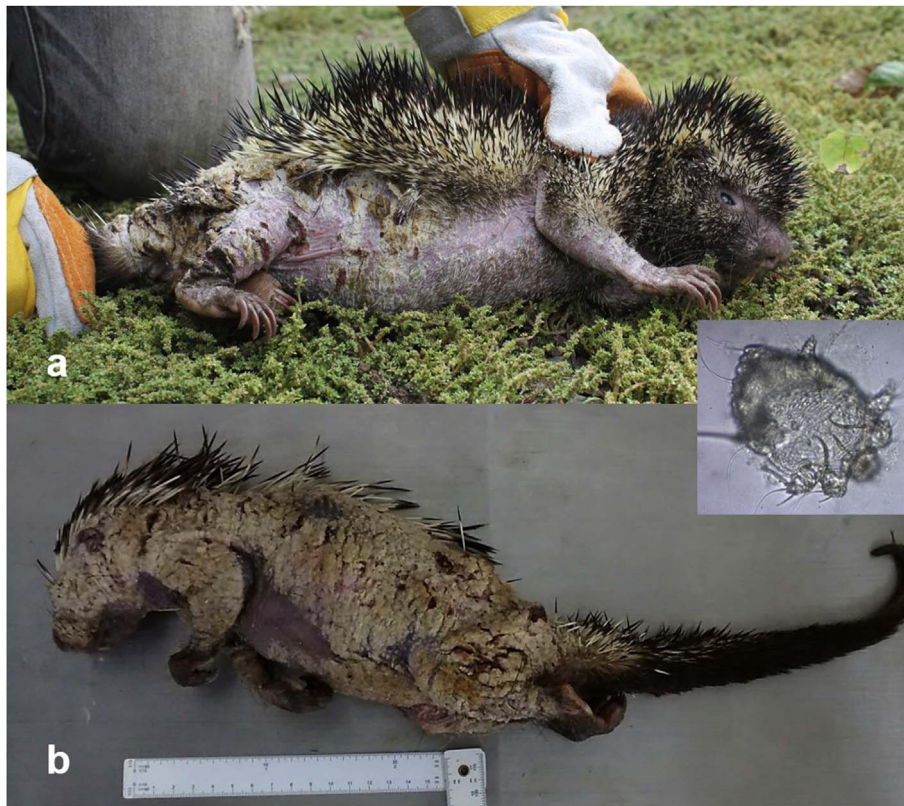
Fig. 1. a-b. Macroscopic lesions of severe sarcoptic mange in two Quichua porcupines ( Coendou quichua ) from central Colombia with a microphotograph of Sarcoptes scabiei (inset). a) Mature male with extensive alopecia affecting ventral, inguinal region, and limbs. b) Mature female with severe hyperkeratosis and alopecia covering 80% of the body.

trapped in the city of Bucaramanga (N 7°08', W 73°00', 959 m) which died under veterinary care and was submitted to the local School of Biology on 06/2016.