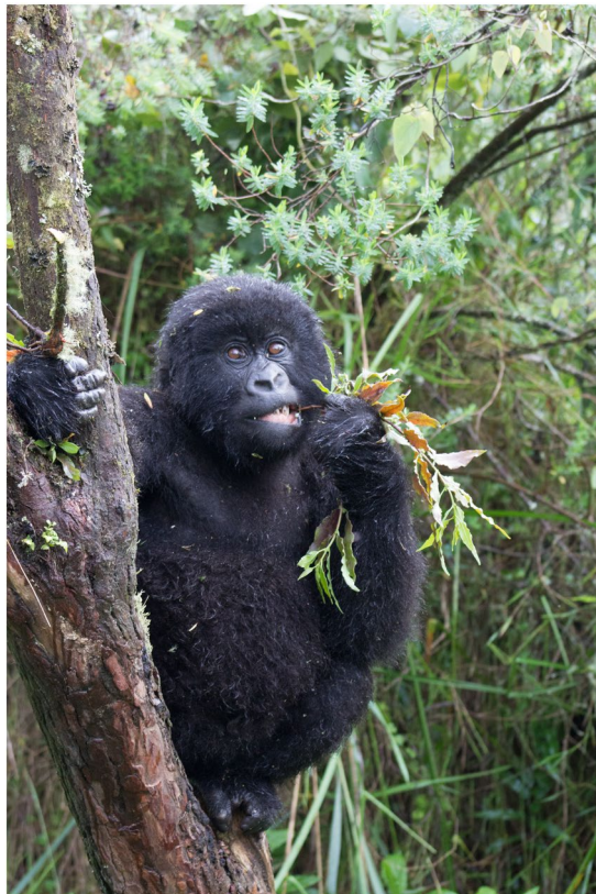
Figure 1. Infant Virunga mountain gorilla chewing and discarding plant pieces in the Volcanoes National Park, Rwanda.

shedding. In addition, archived mountain gorilla blood samples, which had been collected during opportunistic interventions, were examined to identify lymphocryptoviruses circulating in white blood cells ( n = 23 ). We found oral shedding of GbbLCV-1 in 43.0% (143/332) of mountain gorillas, with 48.8% (83/170) of gorillas in the Virunga Massif and 37.0% (60/162) of gorillas in the Bwindi Impenetrable Forest orally shedding GbbLCV-1. Our estimates are likely lower than the true prevalence, given the rugged field conditions surrounding oral specimen collection from chewed plants and the likelihood of intermittent shedding 40 . Prevalence of GbbLCV-1 was not significantly different among conservation regions, age, sex, or family group (Supplementary Table 1).