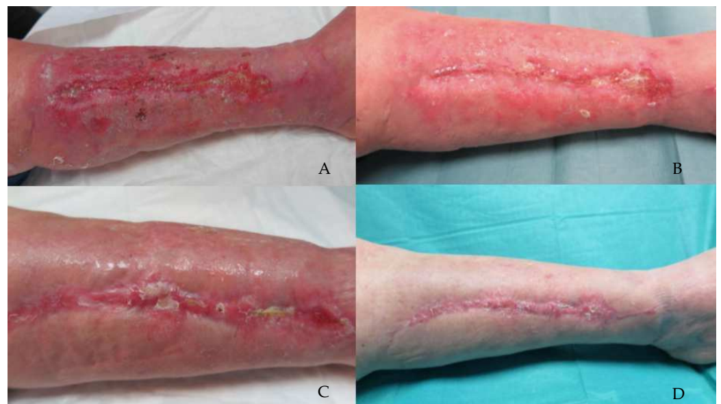
Figure 3. A 75-year-old female patient presented with a wound dehiscence localized on the medial aspect of the left leg. The patient was randomly assigned to the group treated with Connettivina® Bio Plus cream and gauze. (A) Patient in V1. Wound bed is partially covered with fibrin, wound borders and perilesional skin are erythematous, and edema is observed. (B) Wound in V3, wound area sensibly reduced, wound bed exudate decreased considerably, although fibrin remained. Perilesional skin and wound borders improved overall. (C) Wound in V5. (D) V6, wound completely healed, and perilesional skin was a physiologic color.

Group A, Connettivina® Bio Plus; Group B, Fitostimoline® Plus.