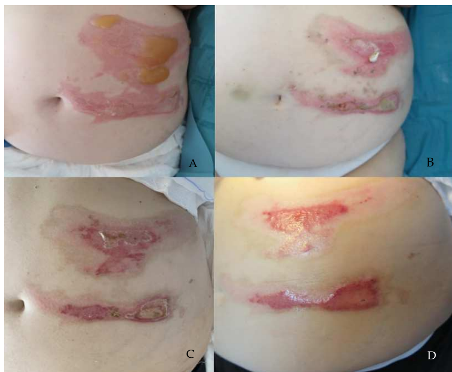
Figure 4. A 69-year-old female patient presented with a first- and second-degree burn lesion localized on the left side of the abdomen. The patient was randomly assigned to the group treated with Fitostimoline ® Plus cream and gauze. (A) Patient in V1, wound bed is covered with blisters; wound borders and perilesional skin are erythematous and edematous. (B) Patient in V3, wound area sensibly lessened (first-degree burn lesion); fibrin could be detected on the wound bed. Edema and erythema subsided significantly. (C) Wound in V5. (D) V6, wound healed completely.