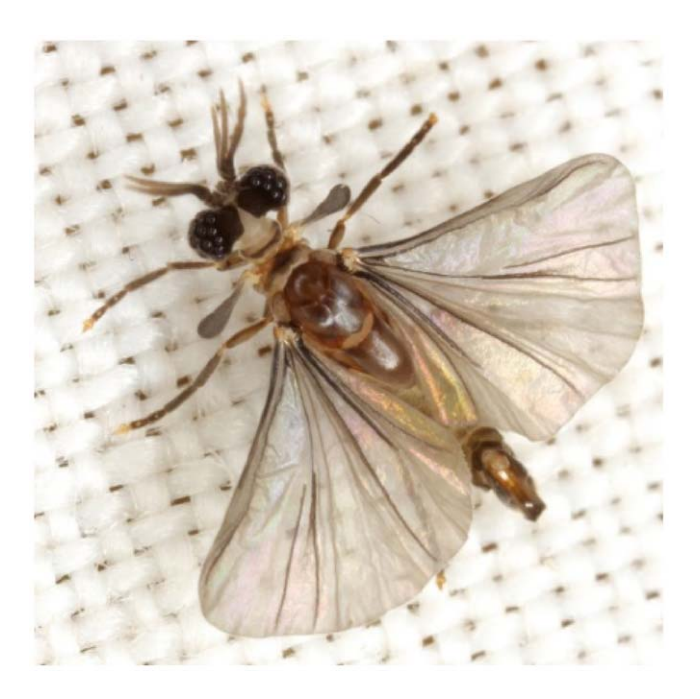
Figure 1. Dorsal view of adult male Corioxenidae (Strepsiptera). doi:10.1371/journal.pone.0011887.g001