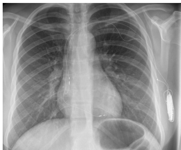
Figure 2 Chest radiograph shows Biotronik Closed Loop Stimulation system, implanted in the axilla.

There was an immediate improvement in the patient's color the following morning and she was able to mobilize better. She was discharged from hospital 4 days after implantation; she had been an inpatient for 6 weeks by this stage. She has had occasional episodes of syncope since discharge; however, her quality of life has greatly improved. She has managed to return to school and has resumed some of her normal activities.