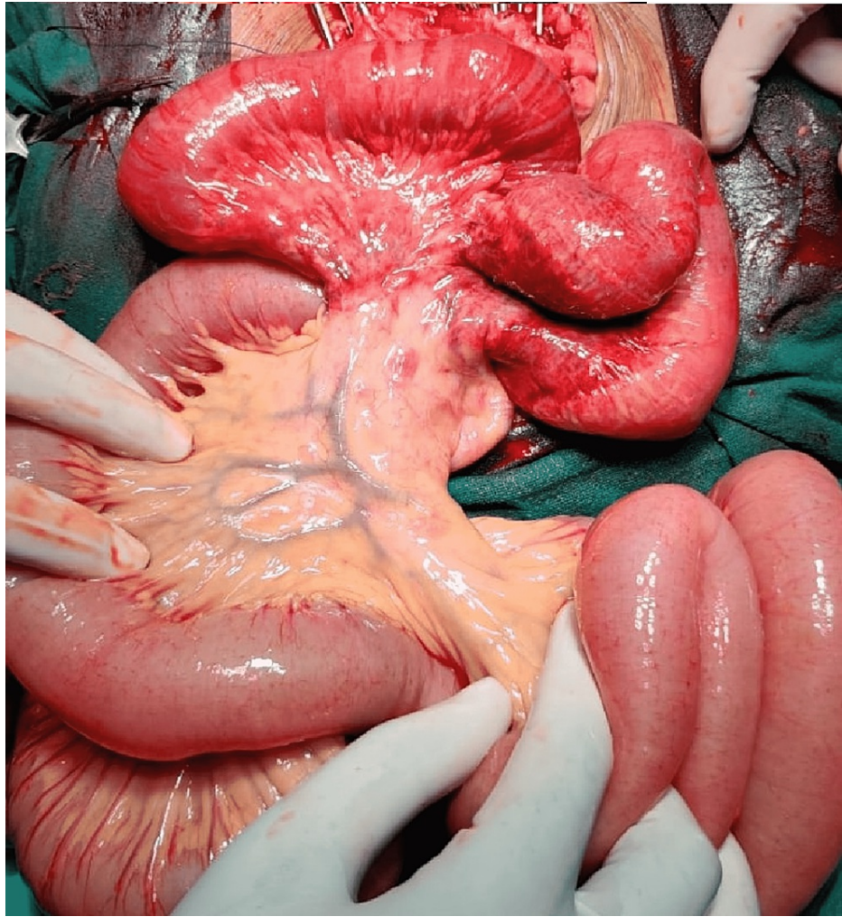
FIGURE 4: Ischemic and gangrenous small bowel

Due to the vicinity of the gangrenous segment to the ileocecal junction, a right hemicolectomy with ileo- colic anastomosis was done. The woman recovered well postoperatively and was discharged after 10 days. The histopathology report of the excised tissue was suggestive of wet gangrene of the ileum.