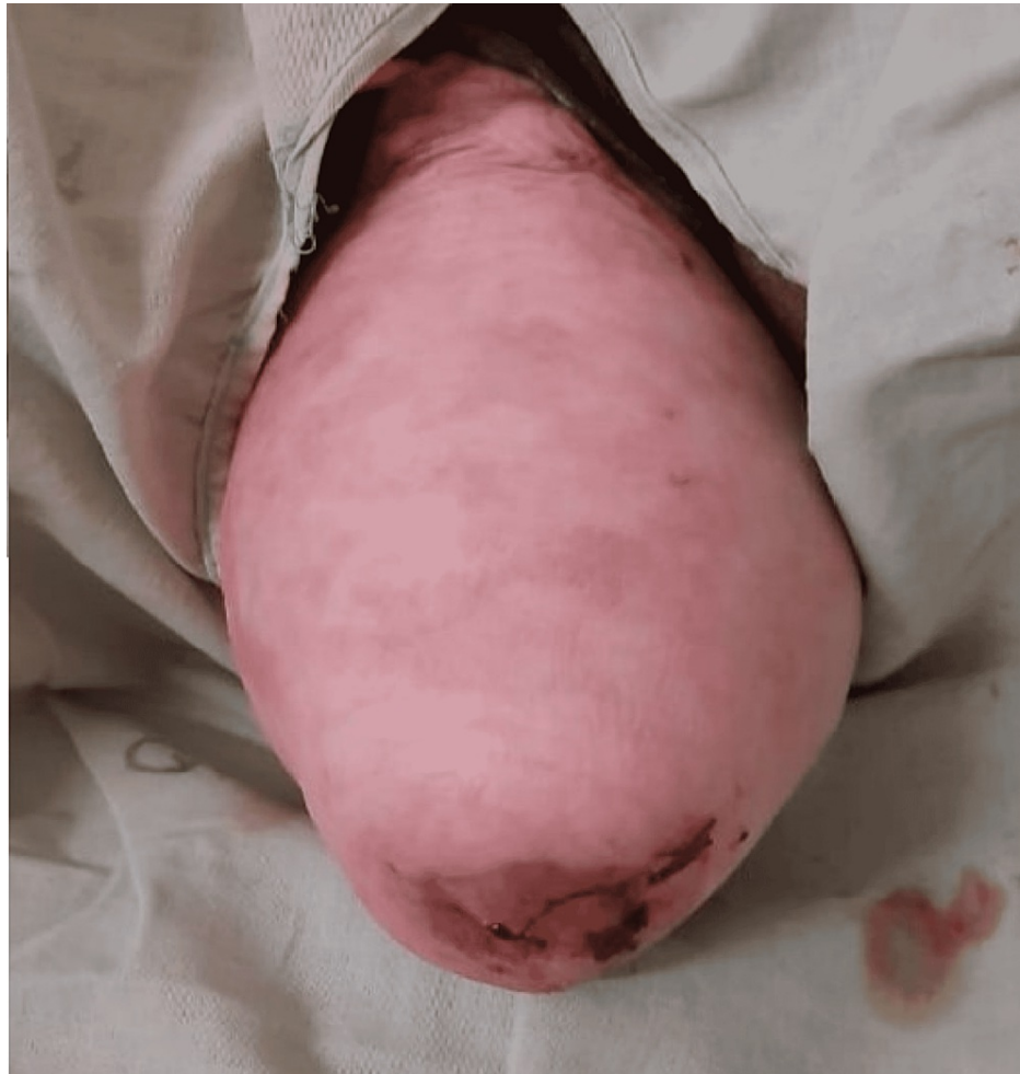
FIGURE 1: Complete procidentia with herniation of the anterior, apical, and posterior compartment of the pelvis through vaginal introitus; decubitus ulcer is seen on the cervix

a history of something coming out of the vaginal introitus for 10 years. Before the acute event, she was relatively all right, and over a period of 12-24 hours, she had retention of urine and associated severe generalized abdominal pain. Thus, she reported to casualty at midnight in spite of the lockdown restrictions and ongoing pandemic. Clinical examination showed that she had third-degree uterine descent, cystocele, rectocele, and eversion of the vagina. A decubitus ulcer was present on the anterior wall of the vagina (Figure 1).