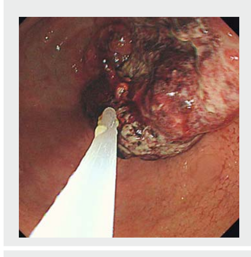
▶ Video 1 Selected case representing use of EndoClot Polysaccharide Hemostatic System (PHS) for acute gastrointestinal bleeding in patients with a gastric malignancy.

ASA, American Society of Anesthesiologists; SBP, systolic blood pressure <sup>1</sup> Data represented as median value (range)