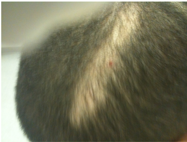
Figure 1 Initial presentation of alopecia on the scalp of an 11-year-old boy.

The patient returned on April 27, 2010, at which time the mother had noted mild improvement, and, on May 11, 2010, she reported some hair regrowth on the medication prescribed (Figure 2). Blood tests were normal, so griseofulvin was continued. When the patient attended a further appointment on June 23, 2010, the mother was unsure if there had been any more improvement. The griseofulvin dose was increased to 250 mg three times daily. Blood tests were normal. The patient returned on July 14, 2010, and acne papules were noted on the face and treated with clindamycin lotion. Laboratory tests were normal. Griseofulvin was continued at 250 mg three times daily.