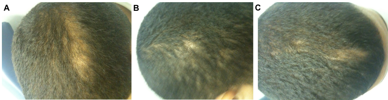
Figure 4 (A–C) Worsening of alopecia seen in three different areas on the scalp at follow-up approximately 1 year after initial visit.

oxiconazole cream twice daily and ketoconazole shampoo daily. Hematology and biochemistry screening continued to be normal, and continued hair loss was reported by the mother.