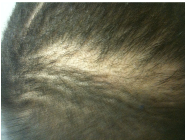
Figure 2 Regrowth noted by provider and patient's mother after 6 weeks of griseofulvin.

The patient returned on November 18, 2010, and the mother reported mild improvement in the appearance of the scalp. Eczema on the abdomen had shown mild improvement with topical steroids and emollients. Because of the negative fungal culture, the condition was considered to be resolved and more oxiconazole lotion was prescribed. The patient returned on January 13, 2011, at which time the mother reported that his hair was falling out again, and the patient himself described itching of the scalp. Another fungal culture specimen was taken from the scalp, and was reported on February 1, 2011 as showing moderate growth of C. laurentii . The patient was seen again on February 24, 2011 and restarted on fluconazole 400 mg once daily. The mother reported that the tinea capitis had returned. Blood tests were normal. The attending physician made the decision to stop fluconazole on February 26, 2011, pending further workup. Oxiconazole lotion was prescribed at a follow-up visit on March 3, 2011. Blood work was normal. The patient was seen again on March 17, 2011, and prescribed