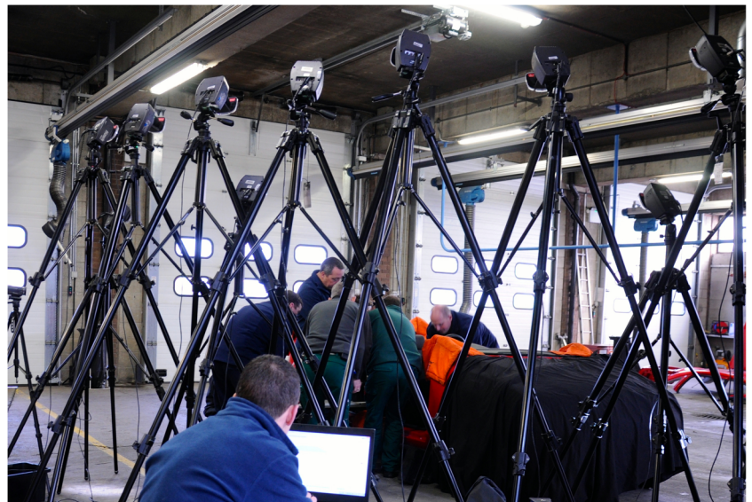
Figure 2 Setup of vehicle and cameras for the extrication scenarios.

Control measurements were taken from the participants during self-extrication under verbal instruction with no collar and the mean cervical spine movement for all participants was 13.33°