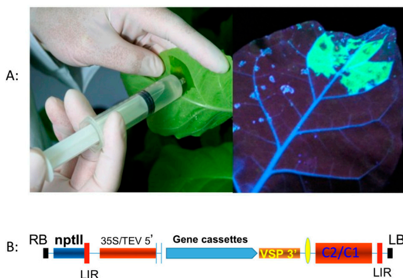
Figure 2. A plant-based transient expression system. Bean yellow dwarf virus (BeYDV) based single-vector DNA replicon system, pBY030.2R, is used to transiently express green fluorescent protein (GFP) in tobacco leaves. (A) Infiltration of Agrobacterium carrying the GFP transgene (Left); and transient expression of GFP (Right). Infiltrated leaf examined with a UV lamp at four days post infiltration; (B) Diagram of the pBY030.2R vector (kindly provided by Hugh Mason, Arizona State University, Tempe, AZ, USA) used in this study. 35S/TEV 5', CaMV 35S promoter with tobacco etch virus 5' UTR; VSP 3', soybean vspB gene 3' element; nptII, expression cassette encoding nptII gene for kanamycin resistance; LIR, long intergenic region of BeYDV genome; SIR (yellow oval), short intergenic region of BeYDV genome; C1/C2, BeYDV ORFs C1 and C2, encoding Rep and RepA ; LB and RB, the left and right borders of the T-DNA region.

for large-scale production of ZMapp. With further optimization of the transient expression system, large-scale production in a short time period (one week) may become feasible [66].