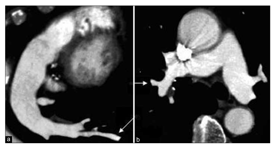
Figure 2: Computed tomography pulmonary angiography in two different patients with suspected pulmonary embolism. (a) With a flow rate of 2.5 mL/s and (b) with flow rate of 2.0 mL/s, Good vascular enhancement can be seen even in more peripheral vessels (arrows).