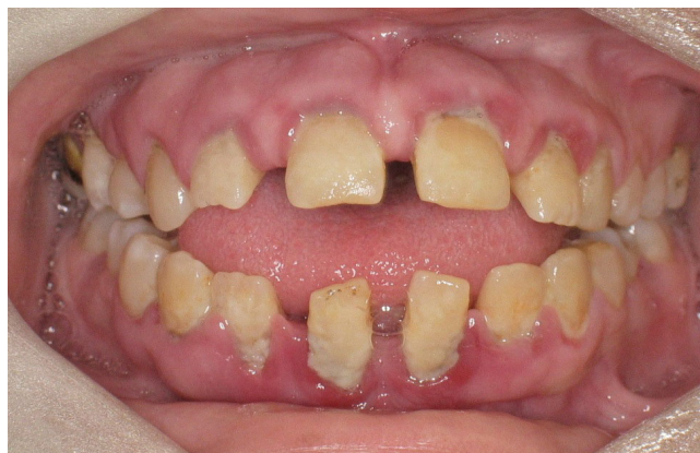
Figure 1 Anterior open bite and spacing is evident.

There were large amounts of supragingival as well as subgingival calculus (Figure 2). The patient reported dental and periodontal sensitivity at the anterior teeth region.