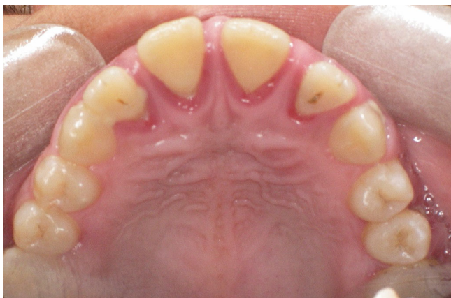
Figure 3 Marginal gingivitis and recession palataly.

Considering the oral clinical and radiological findings the recorded periodontal diagnosis was Generalized Moderate to Severe Chronic Periodontitis associated with systemic disease.