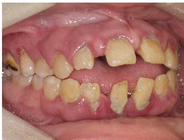
Figure 2 Inflamed gingiva, and plaque deposits.

An orthopantomograph showed severe horizontal alveolar bone loss, especially anteriorly, and vertical bone loss around 31 and 36. Spacing of teeth was evident anteriorly. Multiple proximal radiolucencies were present on posterior teeth (Figure 4).