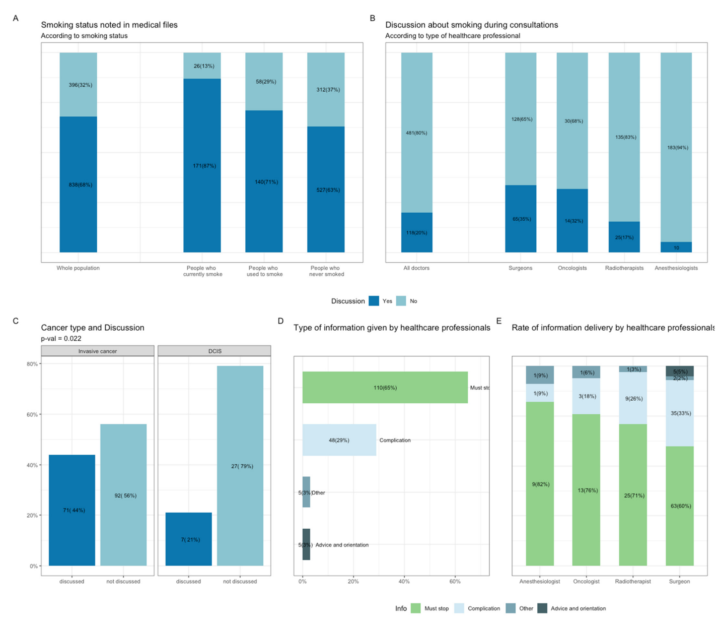
Figure 2. Smoking assessment and counseling by health care professionals at the time of BC diagnosis. ( A ), Smoking assessment reported in electronic health records (EHR) among the whole population and according to smoking status at diagnosis. ( B ), Smoking discussion during consultations with health care practitioners and according to each specialist (Surgeons, Oncologists, Radiotherapists, Anesthesiologists). ( C ), Discussion on tobacco consumption according to cancer type. ( D ), Information type provided by health care professionals. Subcategories were: general advice on smoking cessation (Must stop); treatment complications (Complication); practical advice and orientation (Advice and orientation) and Other. ( E ), Information type according to each specialist. Abbreviation: BC, breast cancer; EHR, electronic health records; BMI, body mass index.