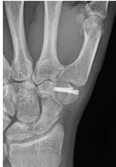
Figure 3: Post-operative plain radiograph.

Isolated fractures of the trapezium are rare and isolated fractures even more so [3–6]. They occur more commonly in conjunction with fractures of the thumb metacarpal or other carpal bones [2, 4, 7]. A fall onto an outstretched hand with the wrist in radial deviation and direct commissural force with shear are reported to be the most frequent mechanisms of injury. Walker et al. [6] have classified fractures of the trapezium into five categories based on the anatomical part involved.