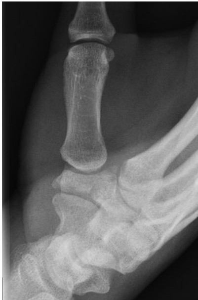
Figure 1: Pre-operative plain radiograph.