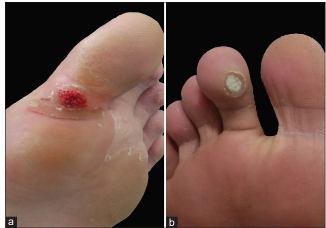
Figure 1: (a) Pinpoint bleeding after needling with 5% 5-FU (b) Frosting after needling with 30% TCA due to coagulation of proteins

TCA 30% solution was obtained by dissolving 30g of TCA crystals in distilled water making up to a volume of 100 ml. 5% 5-FU solution was readily available in ampoules meant for injection. The treatment area was first cleansed with povidone-iodine solution. Local anesthetic (Inj 2% lignocaine) was infiltrated and any overlying callus was removed using surgical blade number 15. This was followed by application of 5% 5-FU or 30% TCA solution over the lesion. A 26-gauge needle was then used to puncture through the solution into the lesion up to the subcutaneous tissue. Each puncture produced pin-point bleeding in the 5-FU group and was continued till the entire lesion was beefy red in color [Figure 1a]. But in the TCA group, there was no bleeding because of coagulation of proteins by TCA and hence needling was continued until there was no more resistance felt [Figure 1b]. The patients were observed for 15 minutes post procedure for any side effects. The total number of punctures varied according to the size of the lesion. Pressure was then applied to the wound with sterile gauze and then dressed with a non-adherent sterile dressing. All the warts in a patient were treated in the same sitting. This procedure was repeated every 4 weeks for 3 sessions or till the clearance of warts, whichever was earlier. Patients were advised to avoid NSAIDs for a period of one week post needling.