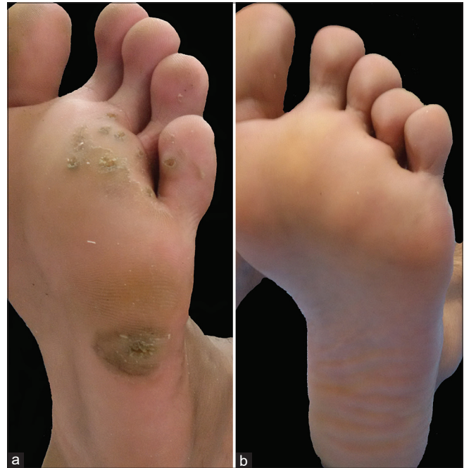
Figure 4: Needling with 5% 5-FU (a) Multiple verrucous papules with thrombosed capillaries before the procedure (b) Resolution of warts after 12 weeks

5-FU is a fluorinated pyrimidine analogue which blocks DNA synthesis by inhibiting thymidylate synthetase and damages the dividing basal layer cells of the epidermis hindering proliferation of viral warts. This antimetabolite drug is most commonly used to treat a variety of skin neoplasms and precancerous lesions, such as actinic keratosis, keratoacanthomas, actinic cheilitis, Bowen's disease, superficial basal cell carcinomas and porokeratosis. [13] Salk et al. studied efficacy of topical 5% 5-FU in plantar warts under occlusion and observed that 19 of 20 patients (95%)